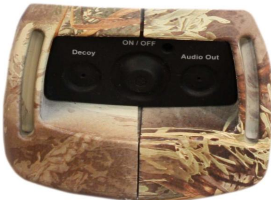
TURBO DOGG SPEAKER - BACK

AUDIO OUT – Add external speaker (not included) for additional sound volume. External speaker rating must be 25watts or greater.