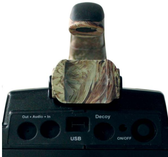
ALPHA DOGG SPEAKER - BACK